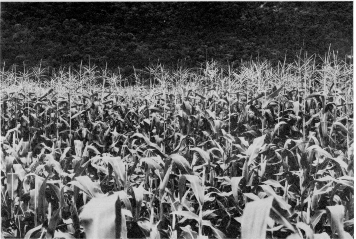
Severe localized deer damage (foreground) to corn.

Deer do not have upper incisors (upper front teeth) and therefore when eating they must jerk or tear the part being eaten from the rest of the plant. This tearing motion tends to leave ragged ends where the leaves or twigs were removed. This raggedness is very obvious on woody twigs browsed in winter but may not be readily noticeable on very tender new growth. In contrast, other animals such as rabbits or woodchucks have both upper and lower incisors and tend to leave very crisp clean cuts.