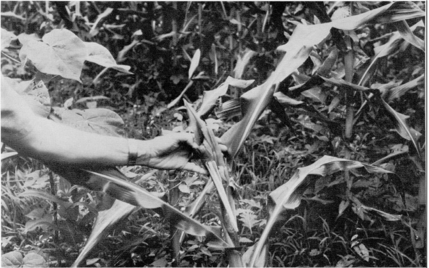
Individual corn plant damaged by a feeding deer.

Deer damage almost never is uniform throughout a field or orchard. The most common site of damage is around the edge of the field where protective escape cover of woods or brush is nearby. Terrain also is used as cover by deer with swales or other areas hidden from view being damaged more frequently. One exception to the above is that in mature corn deer often will cause damage away from field edges. The tall corn provides sufficient cover for the deer to feel secure.