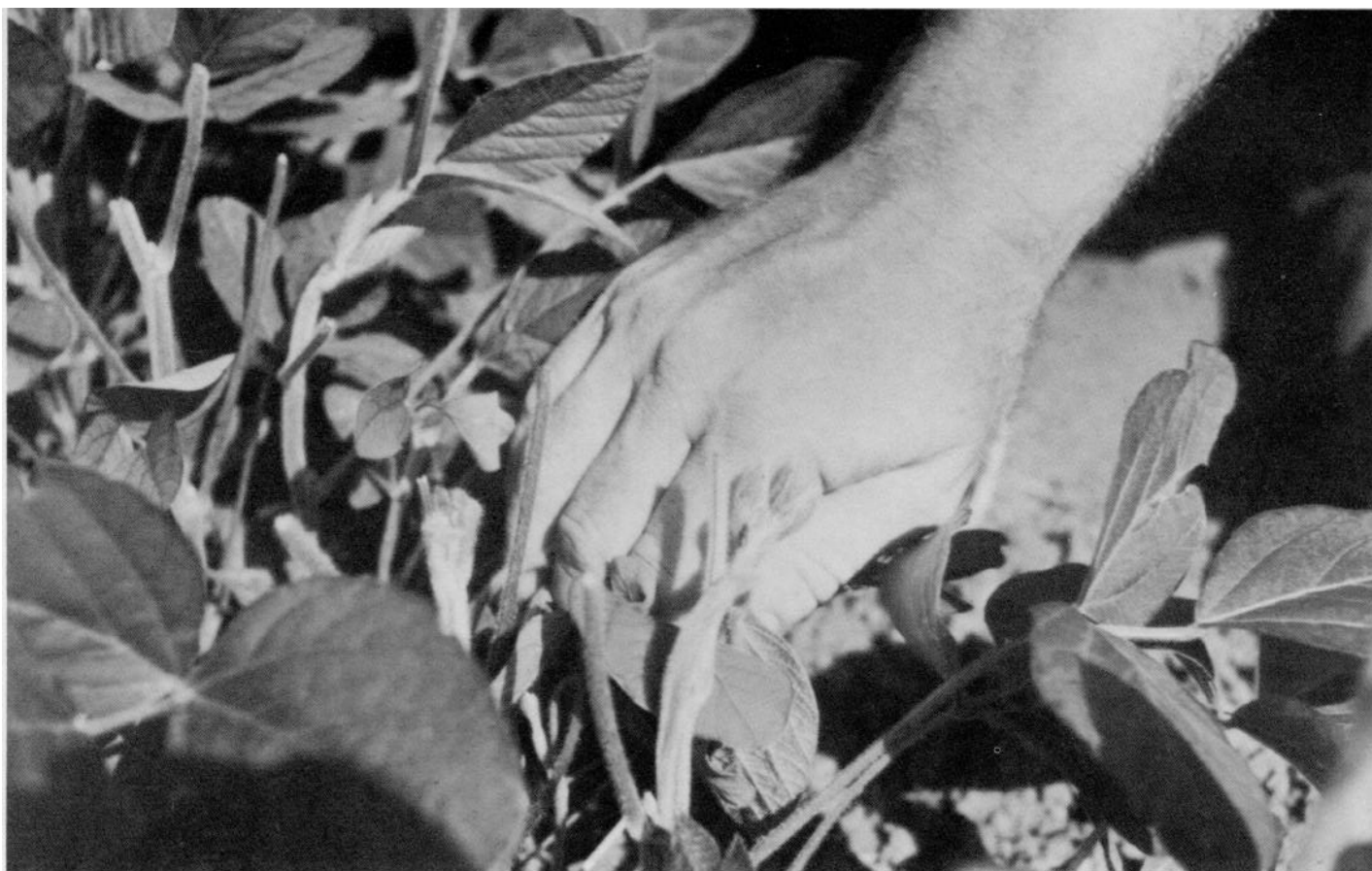
Defoliation of soybeans caused by feeding deer.

Occasionally deer damage may include trampled plants or damaged bark caused by antler polishing. Trampled plants may be found in gardens or row crops that are also receiving damage by deer eating them. In addition, occasionally deer will move to open meadows or hayland at night and bed down. This bedding activity may flatten the plants in an oblong shape 2 to 5 feet long by 2 to 3 feet wide. A single deer may bed several times a night between feedings. Antler rubbing by bucks also can at times be a problem in young orchards, Christmas tree plantations, and nurseries. Bucks rub small trees and saplings to remove the "velvet" once antler growth is complete. Rubs also serve as communication posts. Antler rubbing usually begins in September and has usually ceased by late November. Often the main stem or limbs of saplings may be broken during antler rubbing activities.