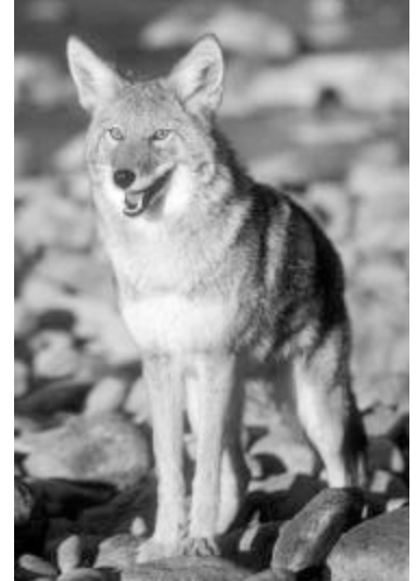
Figure the percentage of losses of each group of livestock to the total for livestock lost to coyotes. Write the percentage on the line beside the value of the loss.