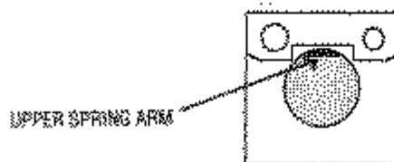
UPPER SPRING ARM

12. Bury the trap just under the grounds surface, leaving the hole in the trap exposed, giving the appearance of a mouse or crayfish hole. Place a small amount of Duffer's Raccoon Bait or other attractant in or near the trap.